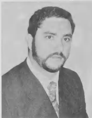
Ph. O. de Souza